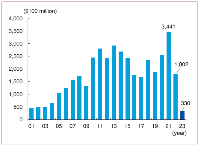
CHART 1 World FDI in China declining

While high-tech sectors are increasingly important not only in terms of the economy but also national security, the US and China have been struggling for the hegemony in these sectors. As this is