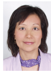
Author Mignonne Chan

This article aims to examine the nature of disasters, assess Taiwan's vulnerability in disasters, provide a conceptual framework for risk management and key actors' roles, and propose an integrated approach to risk management in disasters. The case of Typhoon Morakot in August 2009, the most serious precipitation in Taiwan in the past half-century, is illustrated in the discussion to supplement the theoretical framework with practical experience.